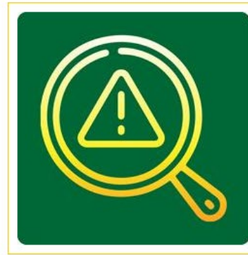
Risk Assessment & Management