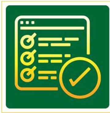
Safety Management Systems