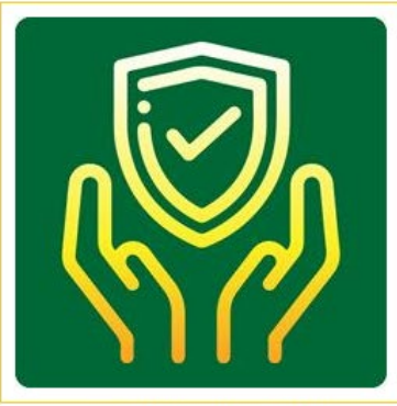
Total Worker Health