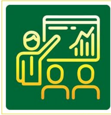
Business & Leadership