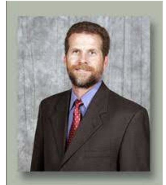
KERNTEC Industries, Inc.

Attend in person at Hodel’s (7:00AM-8:45AM) or attend via Zoom - register here .