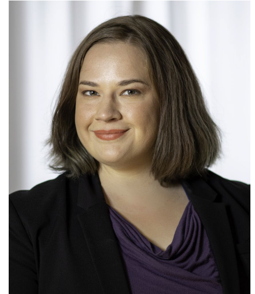
Exploration & Production Geologist, BFD PIO Officer