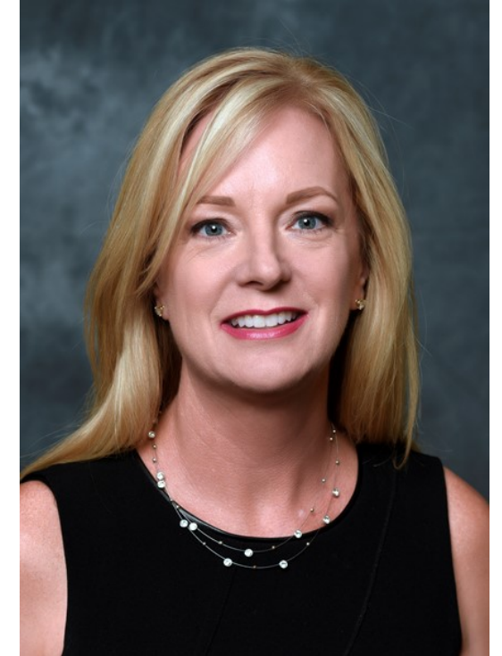
Senior Human and Organizational Performance Advisor, Chevron Technology