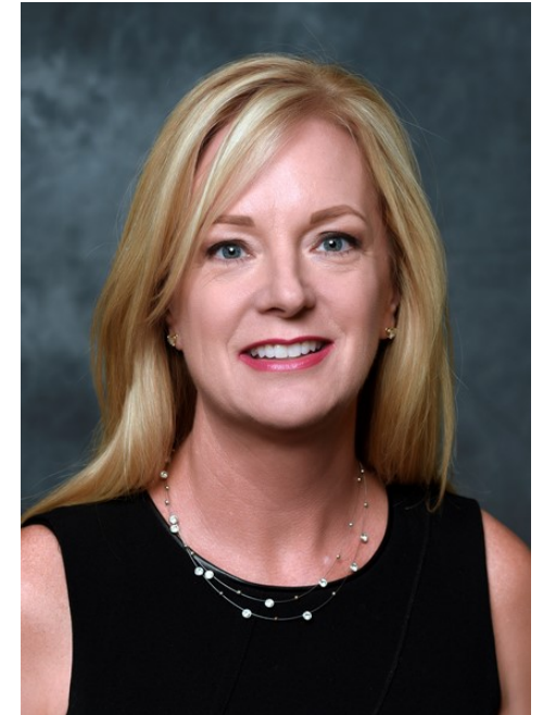
Senior Human & Organizational Performance Advisor, Chevron Technology