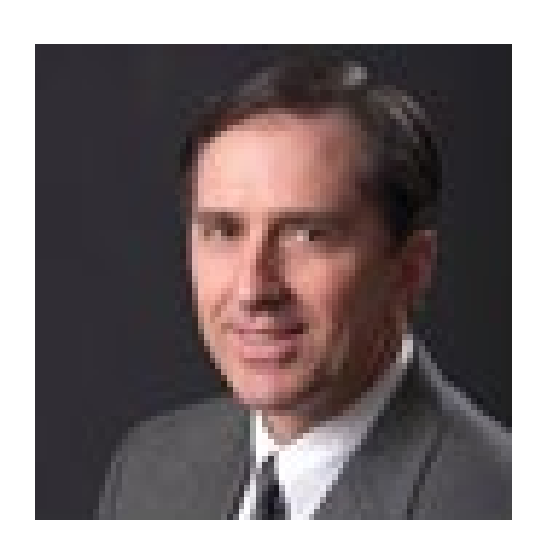
Regional Sales Manager-West Guardian Equipment