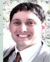
Professional Development Chair