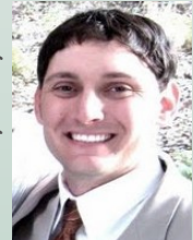
Professional Development Chair