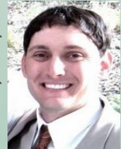
Professional Development Chair